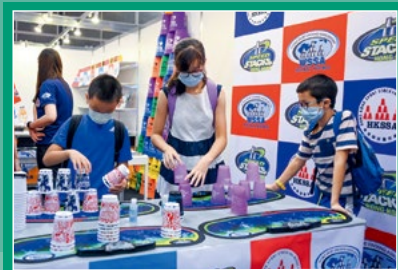
Hong Kong Sports & Leisure Expo 2021