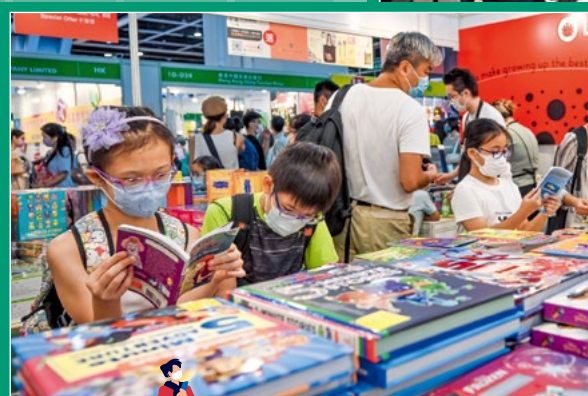
Hong Kong Book Fair 2021