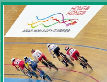
2021 Tissot UCI Track Cycling Nations Cup